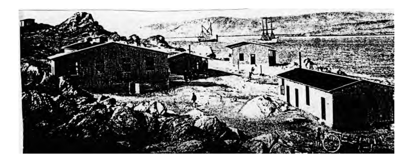
An early German trading post.

19 Study the picture, and then answer the questions which follow.