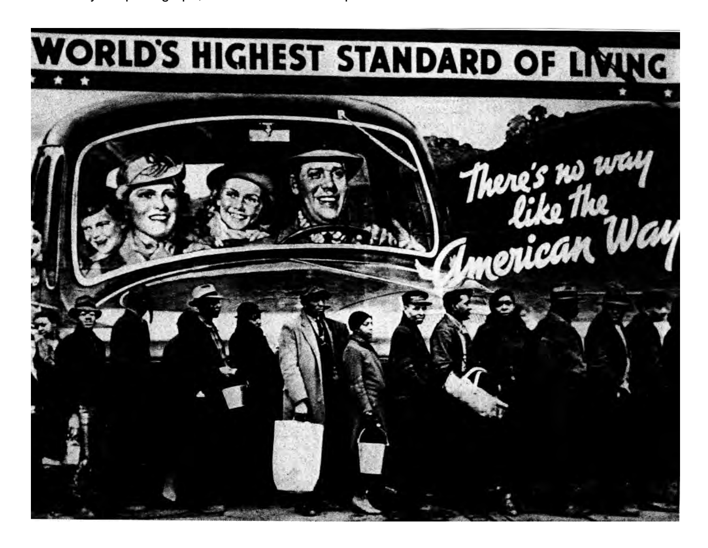
Unemployed people queuing for government relief in 1937.

14 Study the photograph, and then answer the questions which follow.