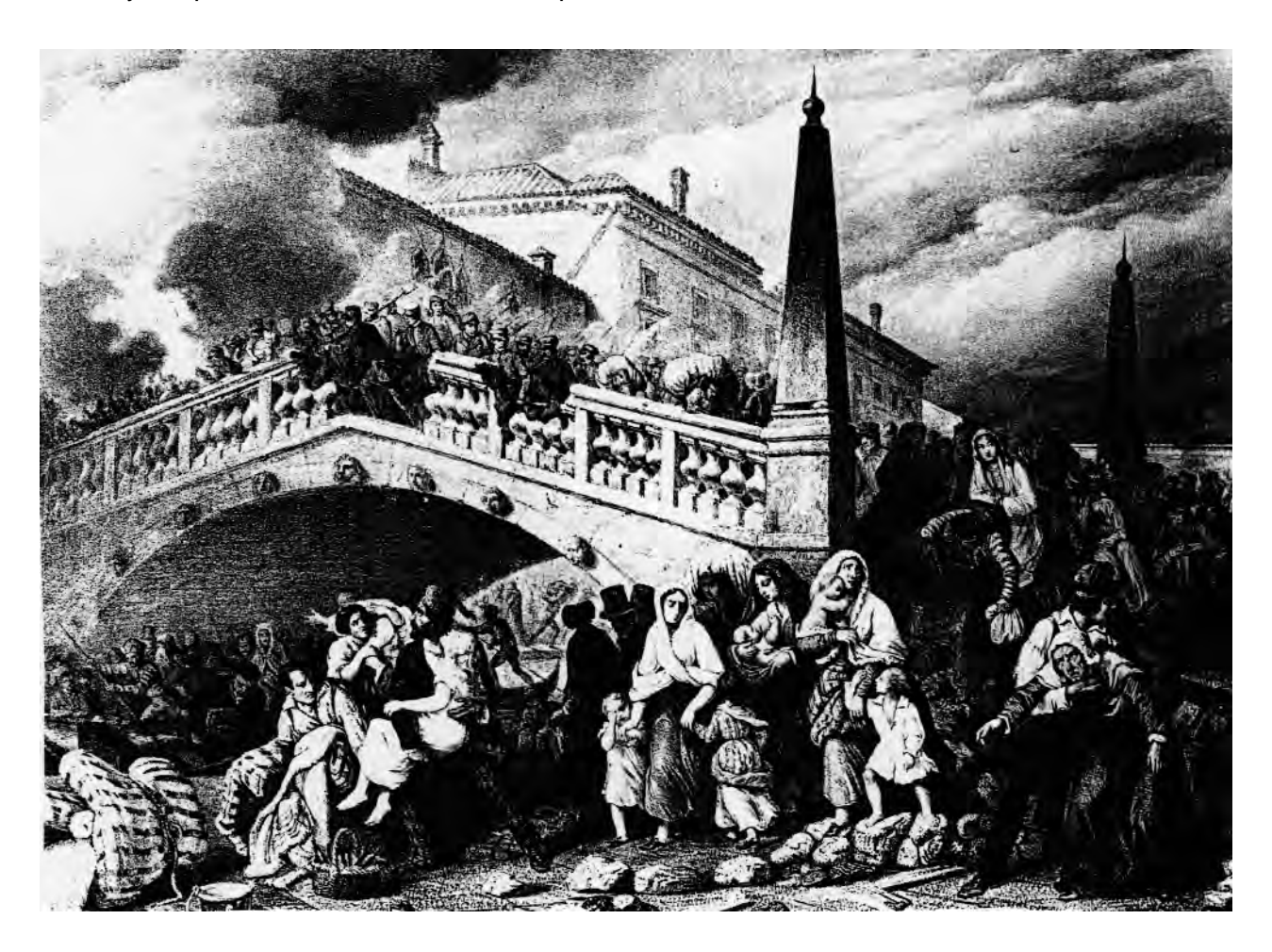
The siege of Venice, 1849

1 Study the picture, and then answer the questions which follow.