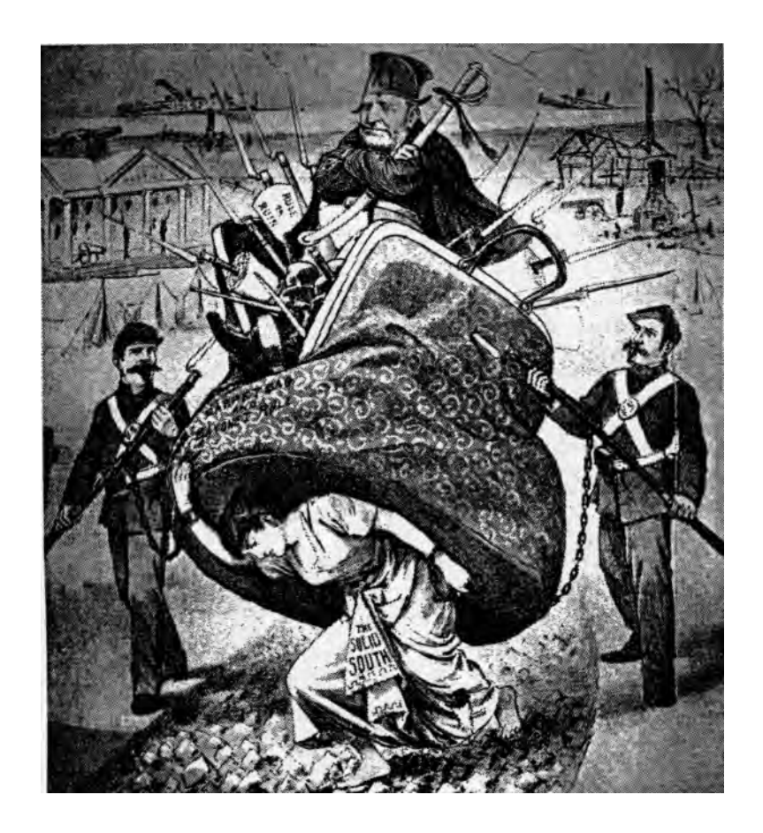
A cartoon of 1880 showing Northern carpetbaggers oppressing the South.

2 Study the cartoon, and then answer the questions which follow.