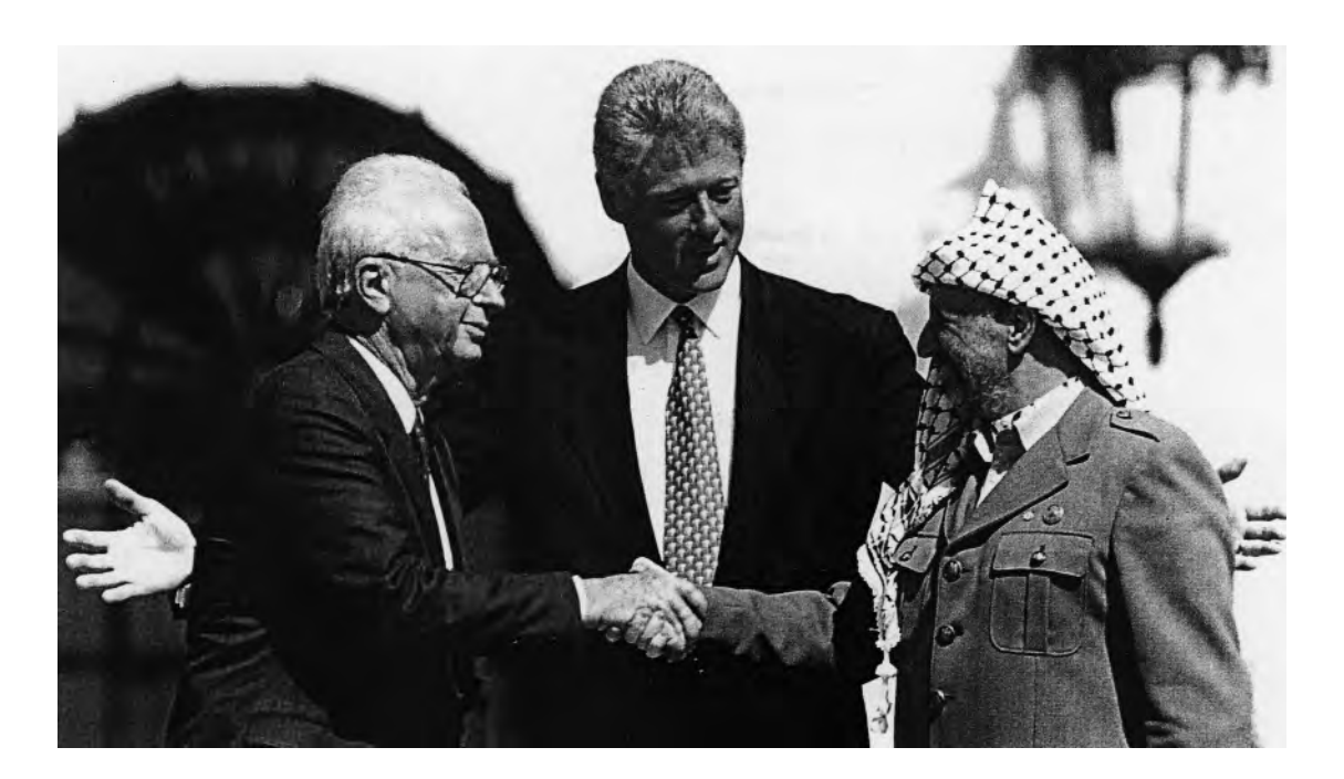
President Clinton with Rabin and Arafat after the signing of the Israeli-PLO peace accord, September 1993.

(a) Describe Sadat's actions in 1977 to bring peace with Israel.